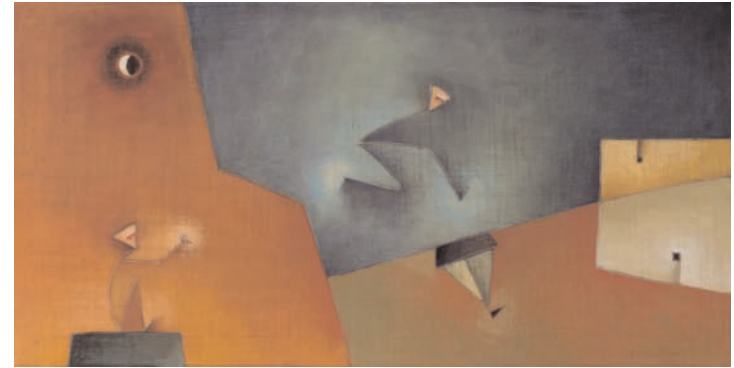
UNA IDEA DE DESPEDIDA / AN IDEA OF FAREWELL. ACRYLIC ON CANVAS, 40 X 80 CM. 2010

Her art is in important collections public and private.