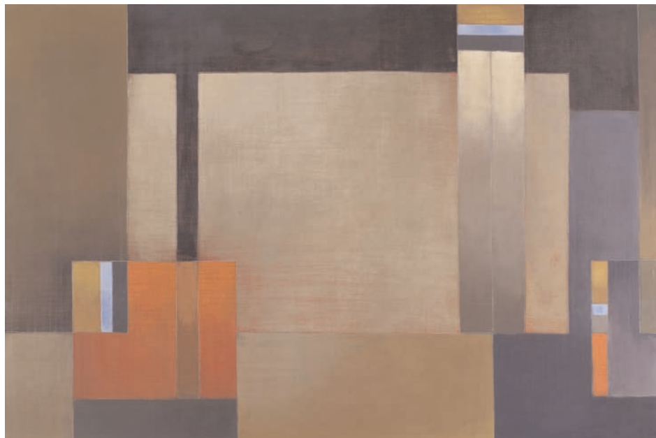
DESPLAZAMIENTO / SLIDE. ACRYLIC ON CANVAS, 80 x 120 CM. 2010