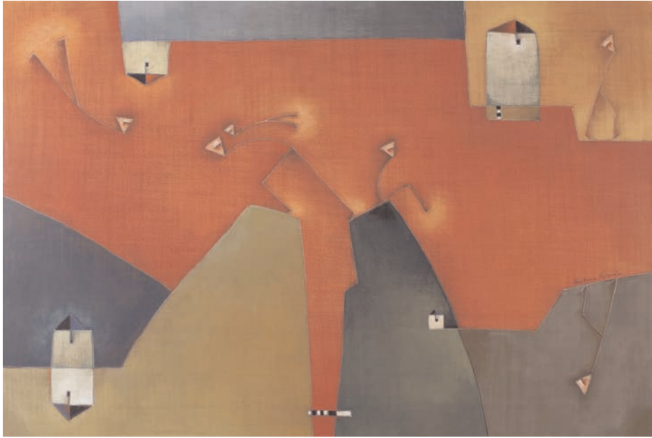
EL CULPOSO / THE CULPRIT. ACRYLIC ON CANVAS, 80 x 120 CM. 2009