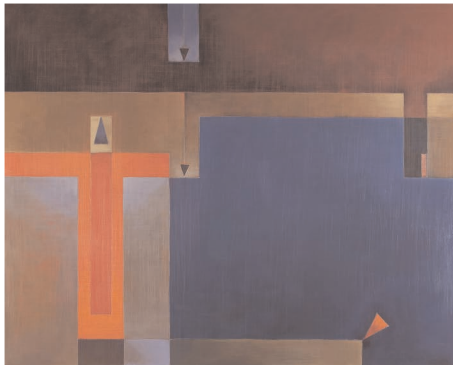
ROJO EN FUGA / RED ON THE RUN. ACRYLIC ON CANVAS, 120 x 150 CM. 2010